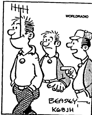
HE'S GOT ONE OF THOSE SENSITIVE FILLINGS THAT PICKS UP RADIO WAVES!

Thursday Morning Breakfast-Micheal's Restaurant in the Safeway Shopping Center, Prescott Valley. 8:00am. All are invited.