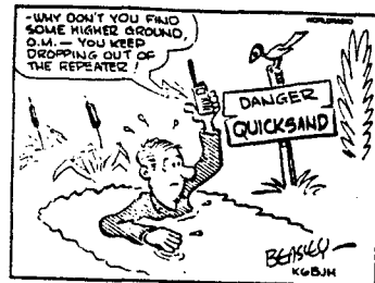
-WHY DON'T YOU FIND SOME HIGHER GROUND, O.M. - YOU KEEP DROPPING OUT OF THE REPEATER!

CARTOONS COURTESY OF WORLD RADIO™ MAGAZINE